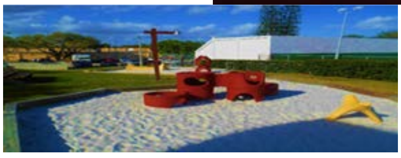
With two playgrounds kids of all ages can join in on the fun, while mom and dad relax.